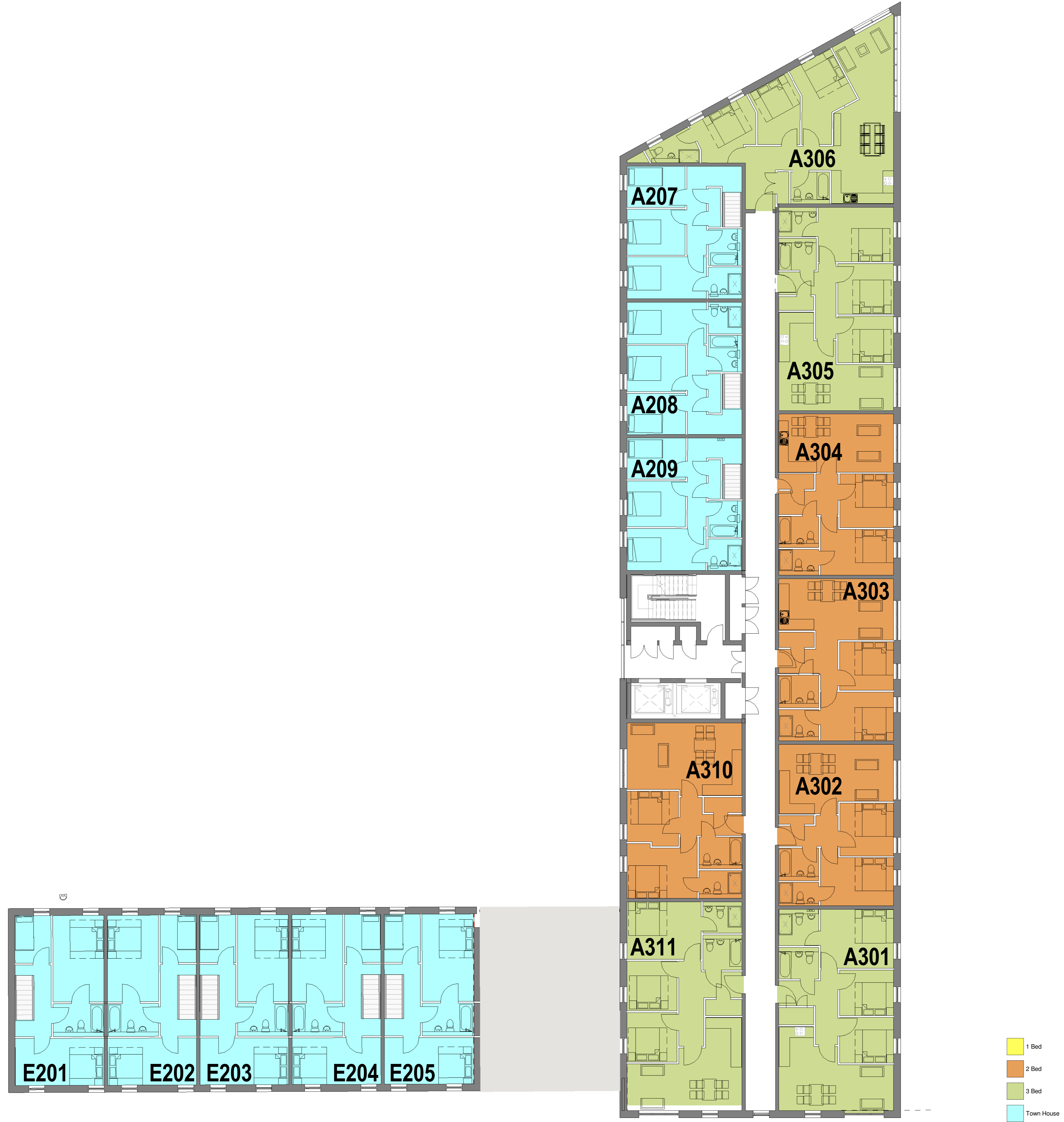
1 Blocks A & E - Third Floor 1 : 100

Revision: Scale: 1 : 100 @ A0 Status: Information Drawn By: DP Checked By: JSC Date: 09/21/17 Client: Regent Plaza Ltd Project: Regent Plaza. Sheet Name: Blocks A & E - Third Floor Drawing Number: 17025_CO-043 Revision: fletcher|rae Architects | Master Planners | Designers Hill Quays, 5 Jordan Street, Manchester, M15 4PY t +44 (0) 161 242 1140 f +44 (0) 161 242 1141 w www.fletcher-rae.com e info@fletcher-rae.com